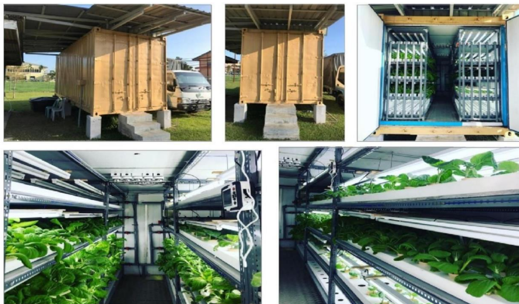
Fig. 2. AgroCube at MARDI

and visualizes the data via the SCADA control panel. All data is synchronized with cloud storage, and the information is displayed on the dashboard to meet the optimum growth requirements of the plants accurately. The AgroCube technology developed by MARDI is as in Figure1.